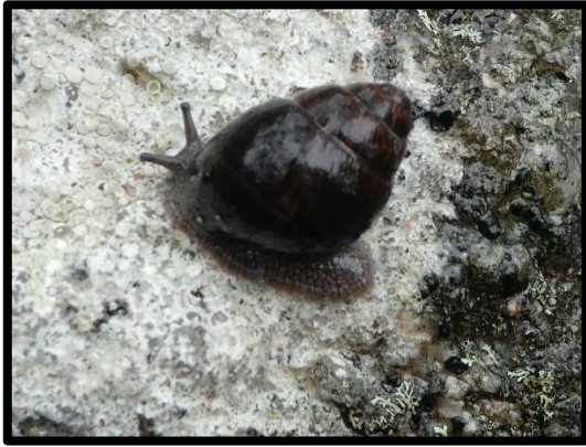
Caryodes dufresnii , snail