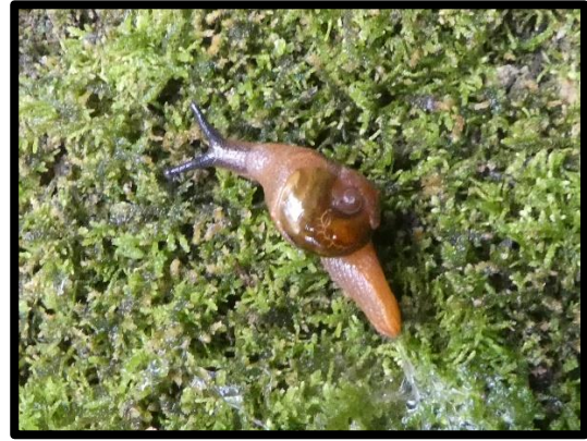
Helicarion cuvieri, semi-slug